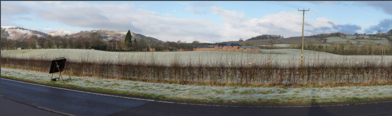
Montage ffotograffig | Photomontage