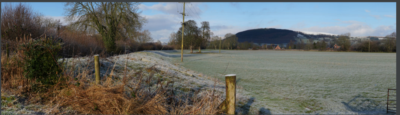
Montage ffotograffig | Photomontage