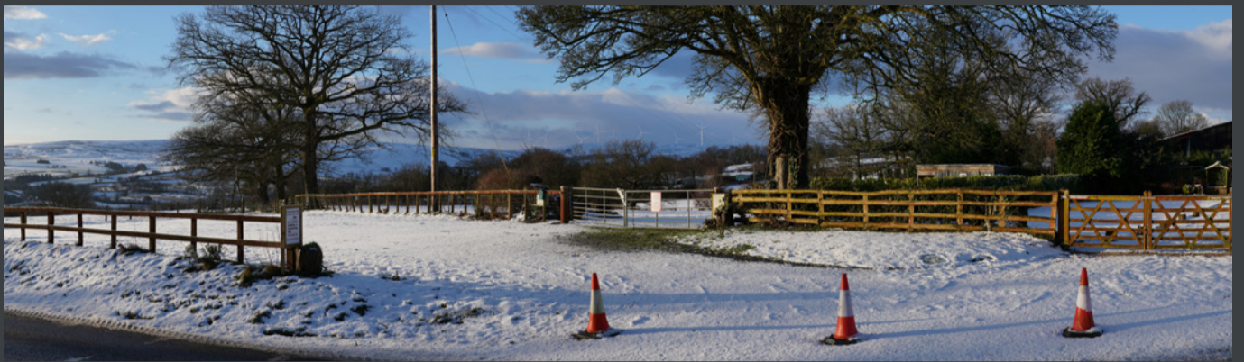
Montage ffotograffig | Photomontage